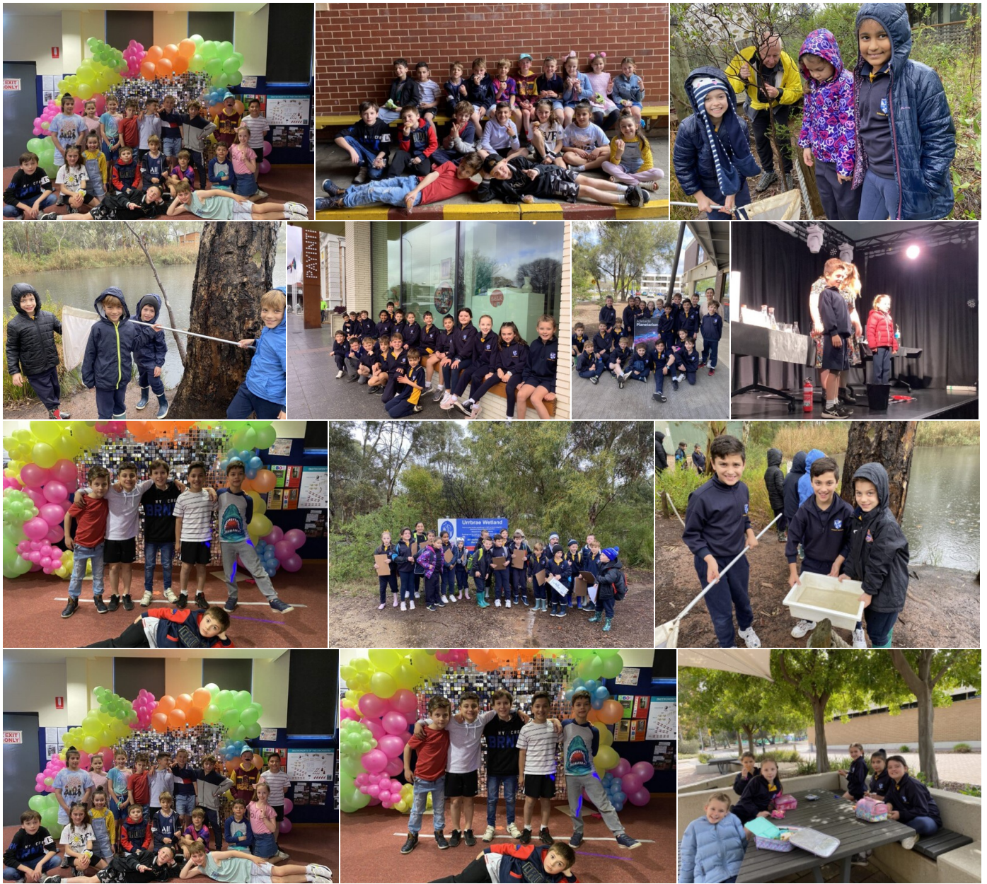
Prospect Spring Fair