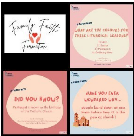
Faith Fact 16 Question