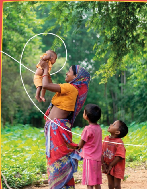
A mother with her children playing outside their home in a remote village in India.

Loving God, We thank you for the gift of our lives and for the life of every person, both near to us and far away. We thank you for the wonder of all your creation. Through fasting, almsgiving and prayer may this Lent draw us deeper into the warmth and light of God's love. May we see the world more clearly, Especially those who are often overlooked. May we come closer to your heart, Which you showed through the cross of Jesus. May we be full of hope for all future generations. We ask this in Jesus' name Amen.