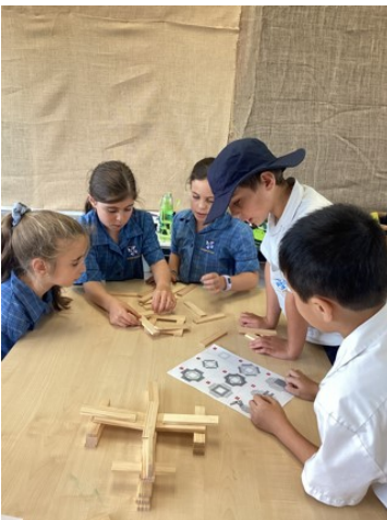
Learning to work collaboratively together