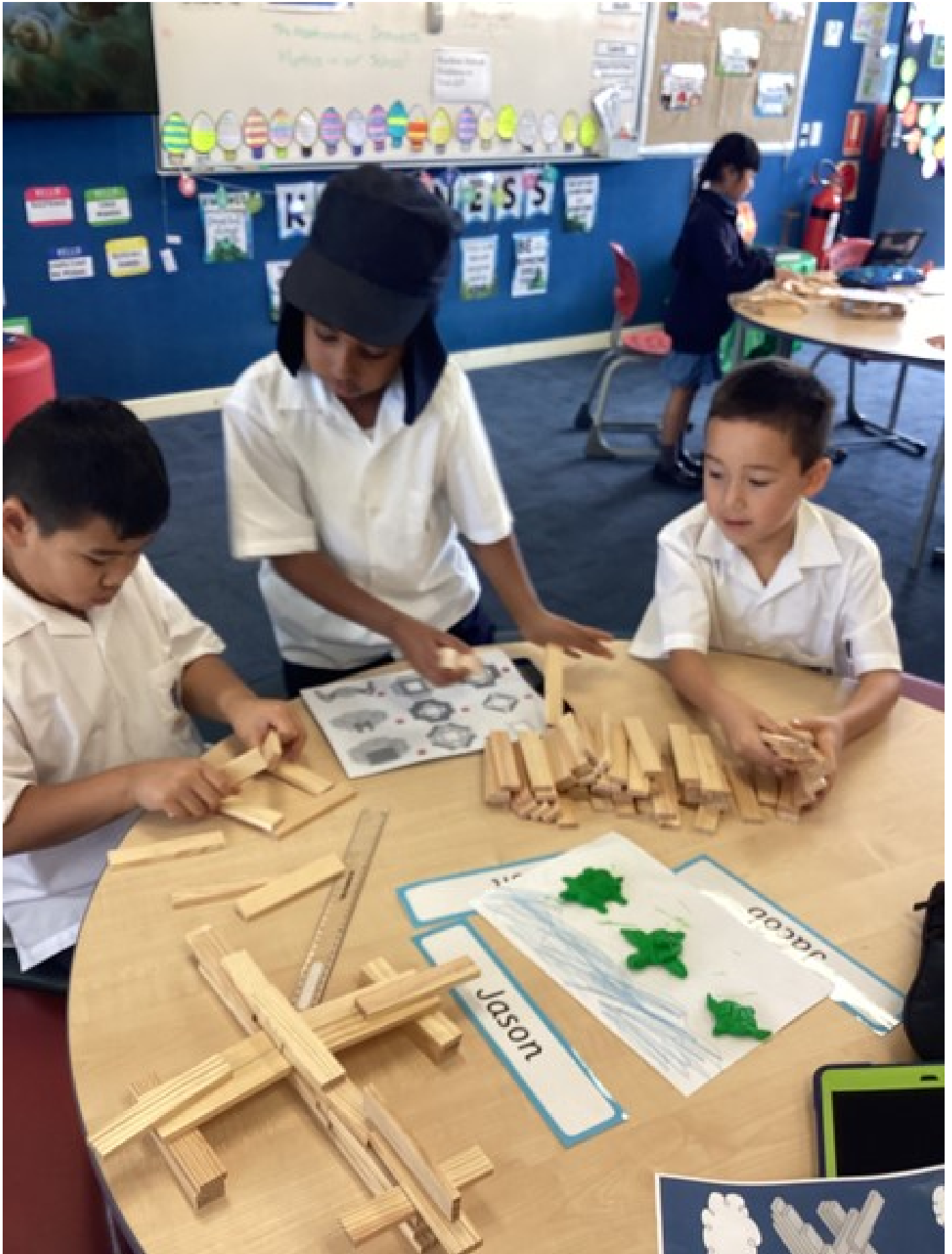
We were so excited to welcome back most of our 3LP class members last week. It was wonderful to share news and discover more about each other in our Flying Start Week. We were involved in many interesting activities and we would like to share some of them with you.