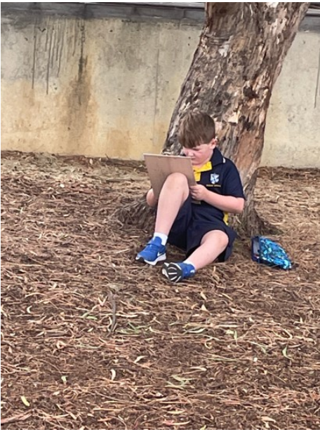
Experiencing the Wonder and Awe of God's Creation