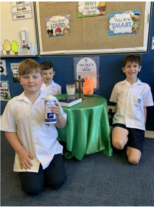
Learning about the School theme for the year, 'Awaken Your Mind'.

One of the activities we completed during the flying start week was an 'All About Me' poster. Students needed to make their t-shirt bright and colourful whilst thinking abstractly about how they could show their favourite food, game, subject and a variety of other favourites.