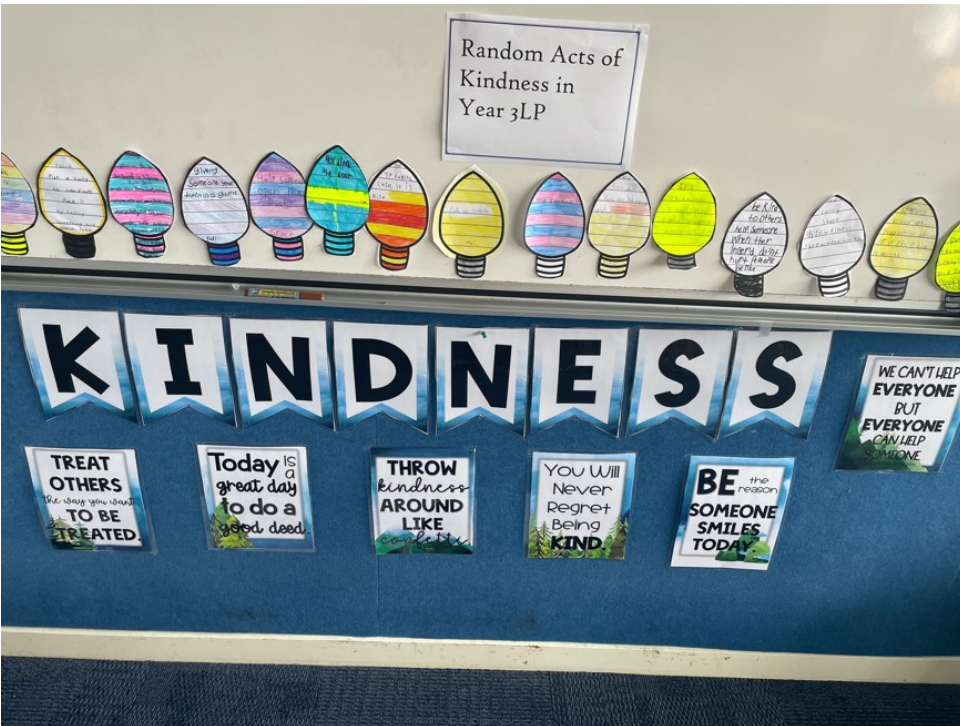
Celebrating Random Acts of Kindness Day and then taking action