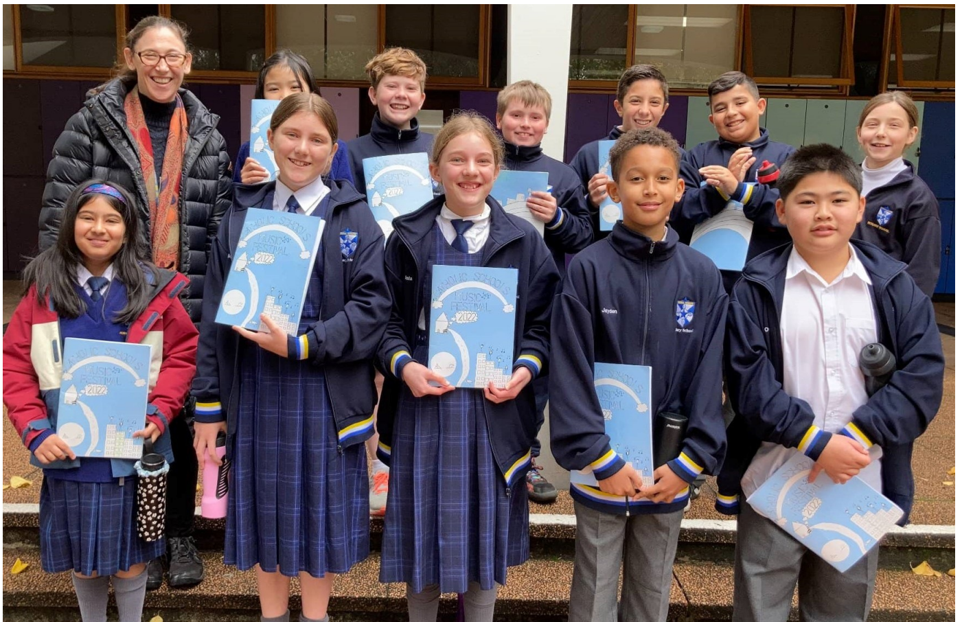
Our Year 5/6 Choir Group preparing for the 2022 Catholic Schools Music Festival which will commence on 26-29 September 2022 at the Adelaide Festival Theatre.