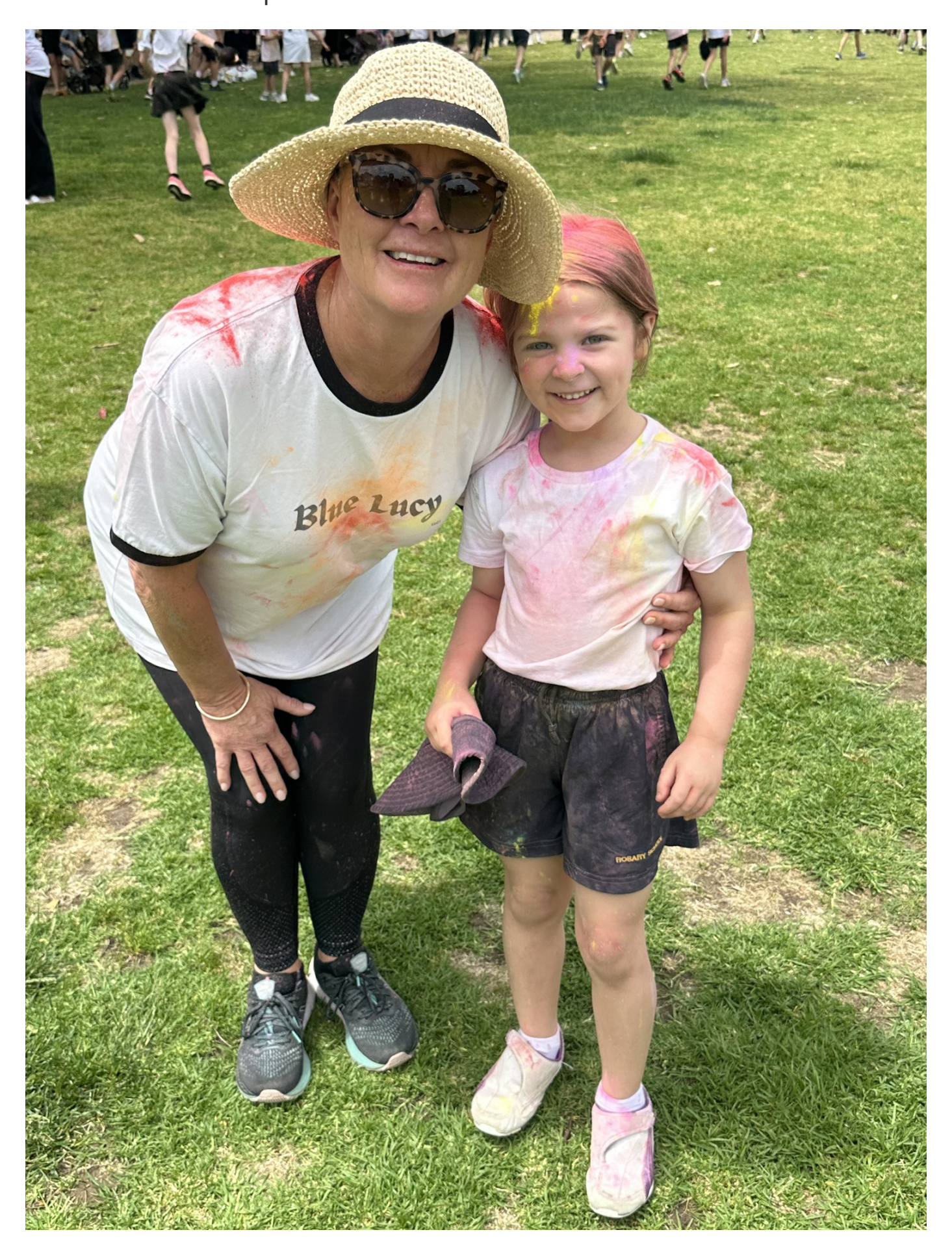
Dear Rosary Community

As we approach the end of the school year, I have spent some time reflecting on the many achievements, growth, and cherished