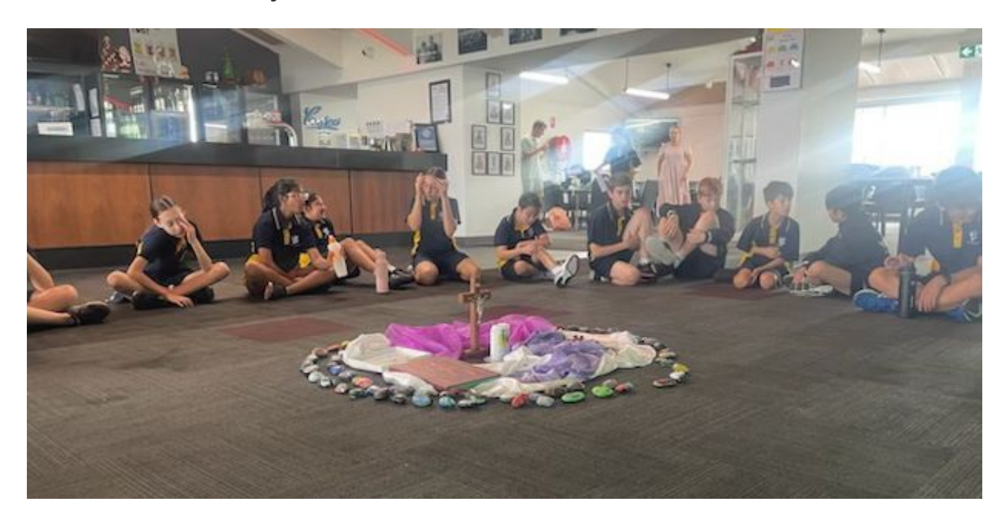
Today, the Year 6 students participated in their Year 6 Reflection Day at Semaphore Surf Life Saving Club. This experience was an ideal opportunity for students to reflect back on the time they have spent at Rosary School and what their primary school experience has meant to them.